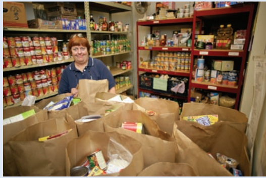
A volunteer at the Loaves and Fishes Food Pantry packs grocery bags with milk, tuna, and other nutritious foods to help families in need.

Guadalupe Center distributes food kits to eligible families once per month. Recipient families must meet the following requirements: 1) proof of at least one child under 18; 2) proof of at least one U.S. Citizen or Legal Permanent Resident; and 3) proof of income at 200% of the federal poverty level. The program's income requirements extend eligibility to middle class families who may be in need of supplemental food due to unemployment or other family hardships.