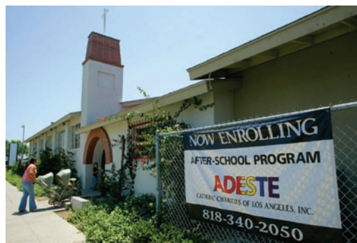
Guadalupe Center in Canoga Park offers Adeste after-school child care and a variety of programs for the whole family.

The family is active in the center's health programs which are operated by Providence Health and Services. In Healthy Kids , children engage in aerobic exercise followed by a healthy