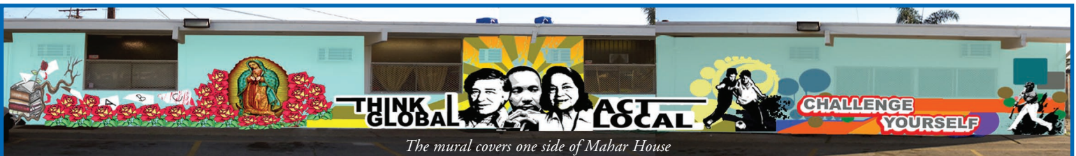
The mural covers one side of Mahar House

Catholic Charities' annual City of Angels Christmas Gala will be held on Friday, December 7, 2012 at The California Club in downtown Los Angeles. The Gala will honor the Archdiocese of Los Angeles Investees of the Equestrian Order of the Holy Sepulchre of Jerusalem, the Sovereign Military Hospitaller Order of St. John of Jerusalem of Rhodes and of Malta, and the Order of St. Gregory the Great. Highlights of the evening will include a special vocal performance by the Norbertine Fathers of St. Michael's Abbey. Proceeds will benefit the poor children and families served by the community centers of Catholic Charities. For more information about the Gala, please call (213) 251-3495 .