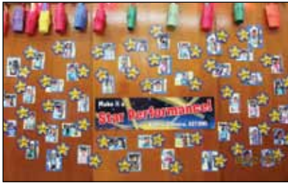
Photos of Star Performers at Brownson House's summer youth program are displayed.

The five-week program was held from 12:00 to 4:30 p.m., Monday through Friday, with one field trip every week. The curriculum included theatre genres such as