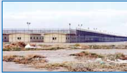
Esperanza's Attorneys Assist Immigrants at the Mira Loma Immigration Detention Center

Since 2008, Catholic Charities of Los Angeles' Esperanza Immigrant Rights Project has given free immigration law classes at the Mira Loma Immigration Detention Center in Lancaster, California. Immigrants do not have the legal right to a public defender in Immigration Court and must either pay for a lawyer or represent themselves to remain in the United States.