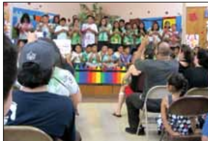
Children perform for parents and friends at the variety show.

They also learned about science at the Discovery Science Museum in Santa Ana and enjoyed a barbecue at the Santa Fe Dam, in conjunction with the Park School, Alhambra, summer program. A trip to Knott's Berry Farm concluded the field trips. At the end of the five-week program, the children presented a variety show and held an open house for their families and friends. The show included six performances that promoted love, peace, and faith. The children sang and interpreted the songs, Day by Day and Imagine , using American Sign Language. There was also a hip hop number and ribbon dance, as well as solos and duets. In the skit, the Parable of the Good Samaritan , the children pretended to be teachers, robbers, and donkeys. The children transformed the stage and room with paintings, drawings, origami bugs, and a six-foot paper tree.