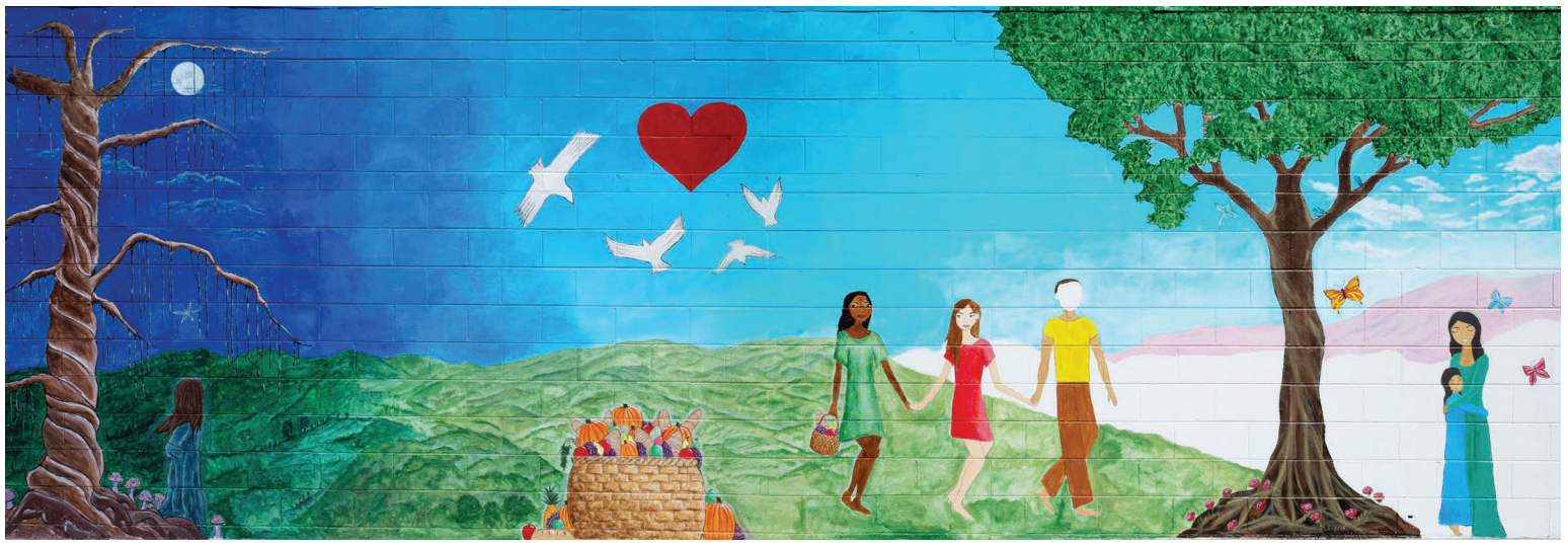
"The Miracle is Sharing," a new mural at Catholic Charities' Loaves and Fishes program, inspires clients with its message of hope.