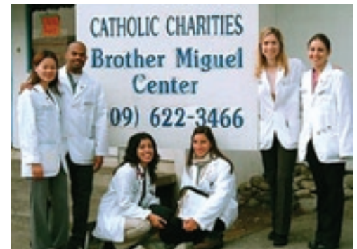
Students from Western University of Health Sciences organized a free medical clinic for the homeless and extremely low-income people at Brother Miguel Center in Pomona.

grows, the students hope to regularly organize free clinics at the Brother Miguel Center (at least two in the next semester) as well as mobile clinics serving the greater Pomona area.