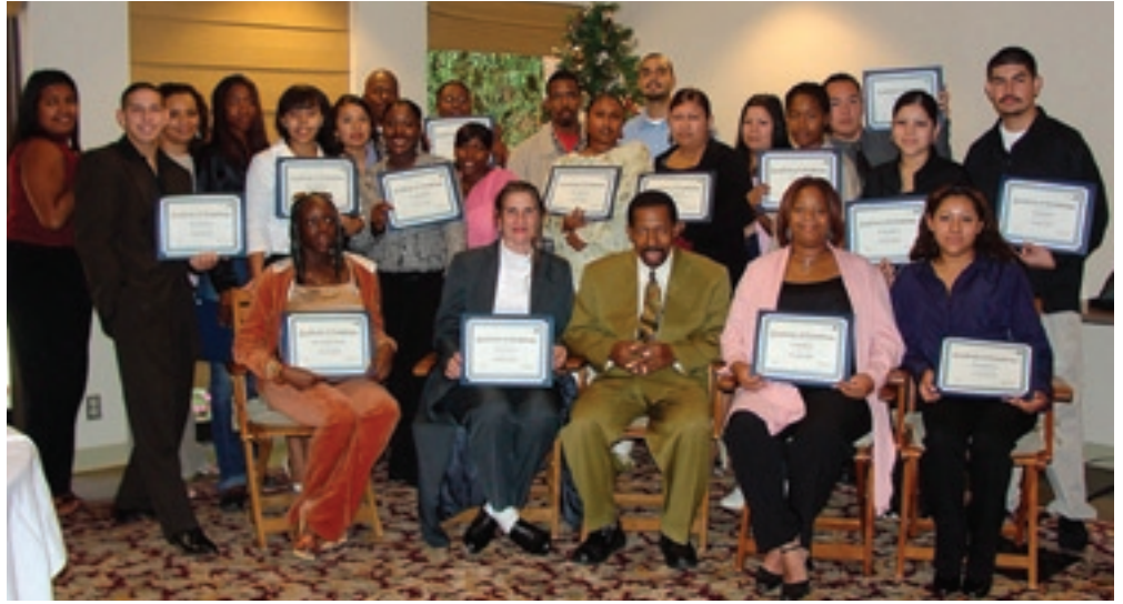
The graduates of the AYE Bank Teller Training Course display their certificates.

On October 18, Catholic Charities' Archdiocesan Youth Employment Services (AYE) initiated a Bank Teller Training Course near USC's main campus. The participants were among the first class of students to enroll in the newly created program offered by L.A. Trade Tech College (LATTTC). USC's Educational Opportunity Programs Center (EOPC) offered the classroom space and computer access.